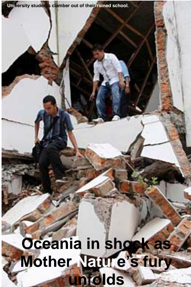
University students clamber out of their ruined school.

Oceania in shock as Mother Nature's fury unfolds