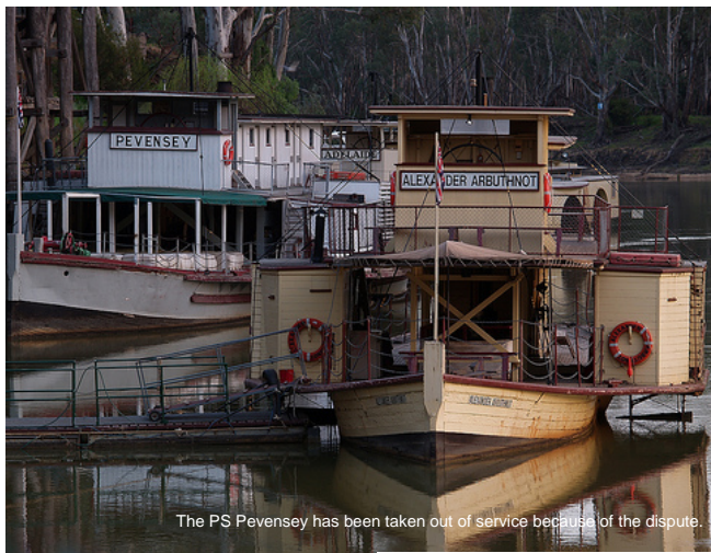
The PS Pevensey has been taken out of service because of the dispute.