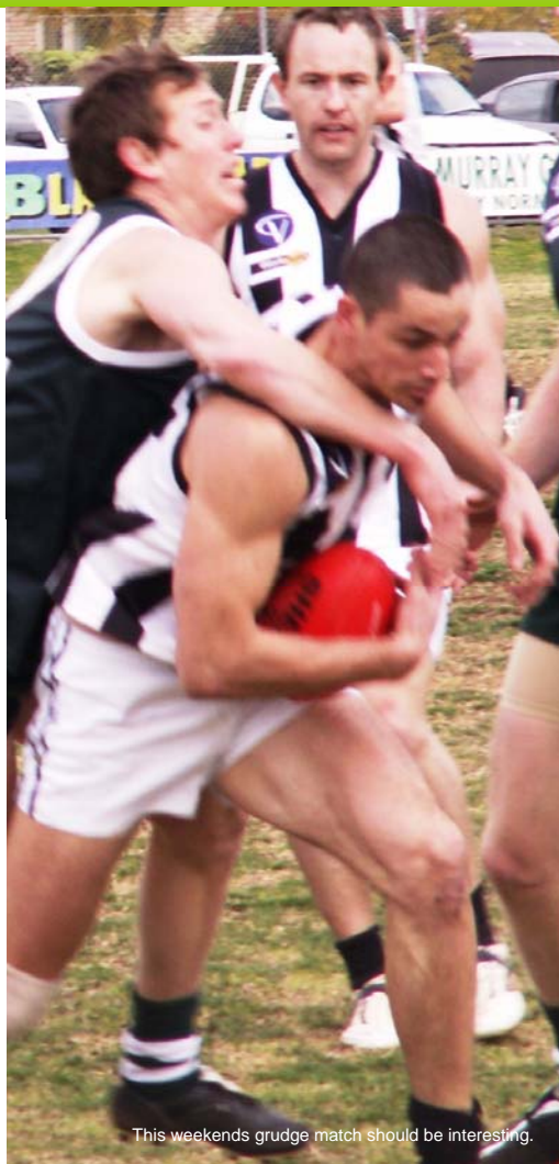
This weekends grudge match should be interesting.

Although most have their money on Rochester, Echuca has been known in the past to surprise the spectators.