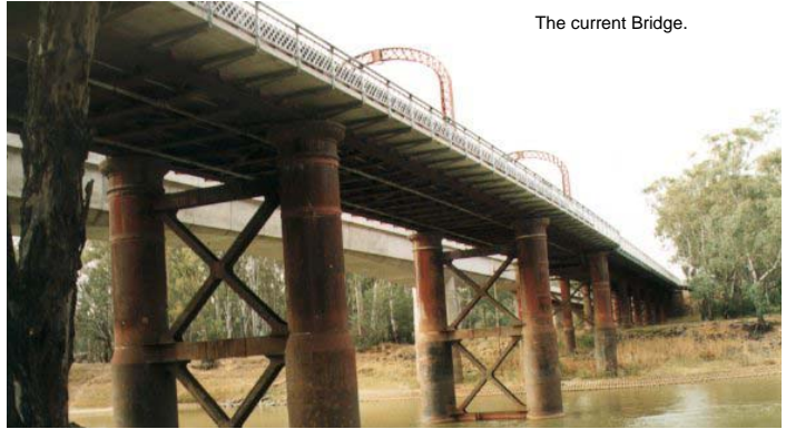
The current Bridge.

After a shocking study found the current Bridge couldn't cope with future traffic loads, three proposals were put forward as potential new Bridge sites. One proposal was for a Bridge to go right next to the existing Bridge, now known as the Central Option. But the council didn't want it there, and after a short spat it was ruled out as an option. Then the Eastern Option was assessed, a much larger looking option, that drove