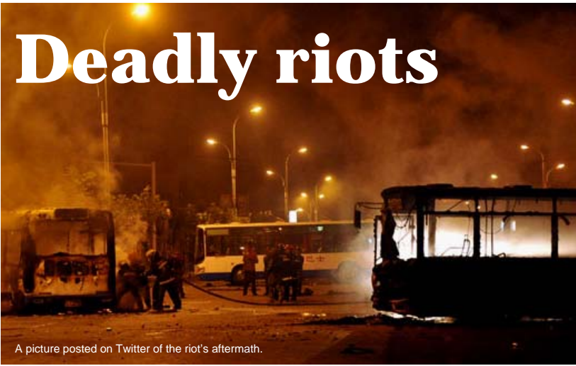
A picture posted on Twitter of the riot's aftermath.