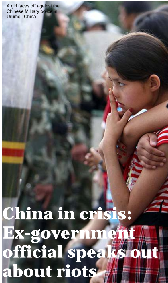
A girl faces off against the Chinese Military police in Urumqi, China.