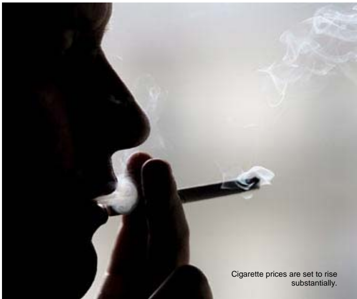
Cigarette prices are set to rise substantially.

The proposed taxes would make a pack of 30 cost over twenty dollars – and in today’s financial crisis, that would be an even bigger