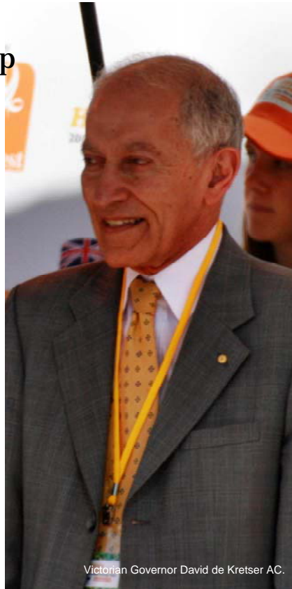
Victorian Governor David de Kretser AC.

The de Kretser's also plan to visit a working dairy farm, to see a cow produce milk (11,500 litres of milk actually). The Campaspe Shire stated in a media release: "Also on the itinerary is a visit to a privately owned company which is a leading provider of material movement solutions, including conveying and line control, palletising, robotic automation and complete project delivery." Umm, what?